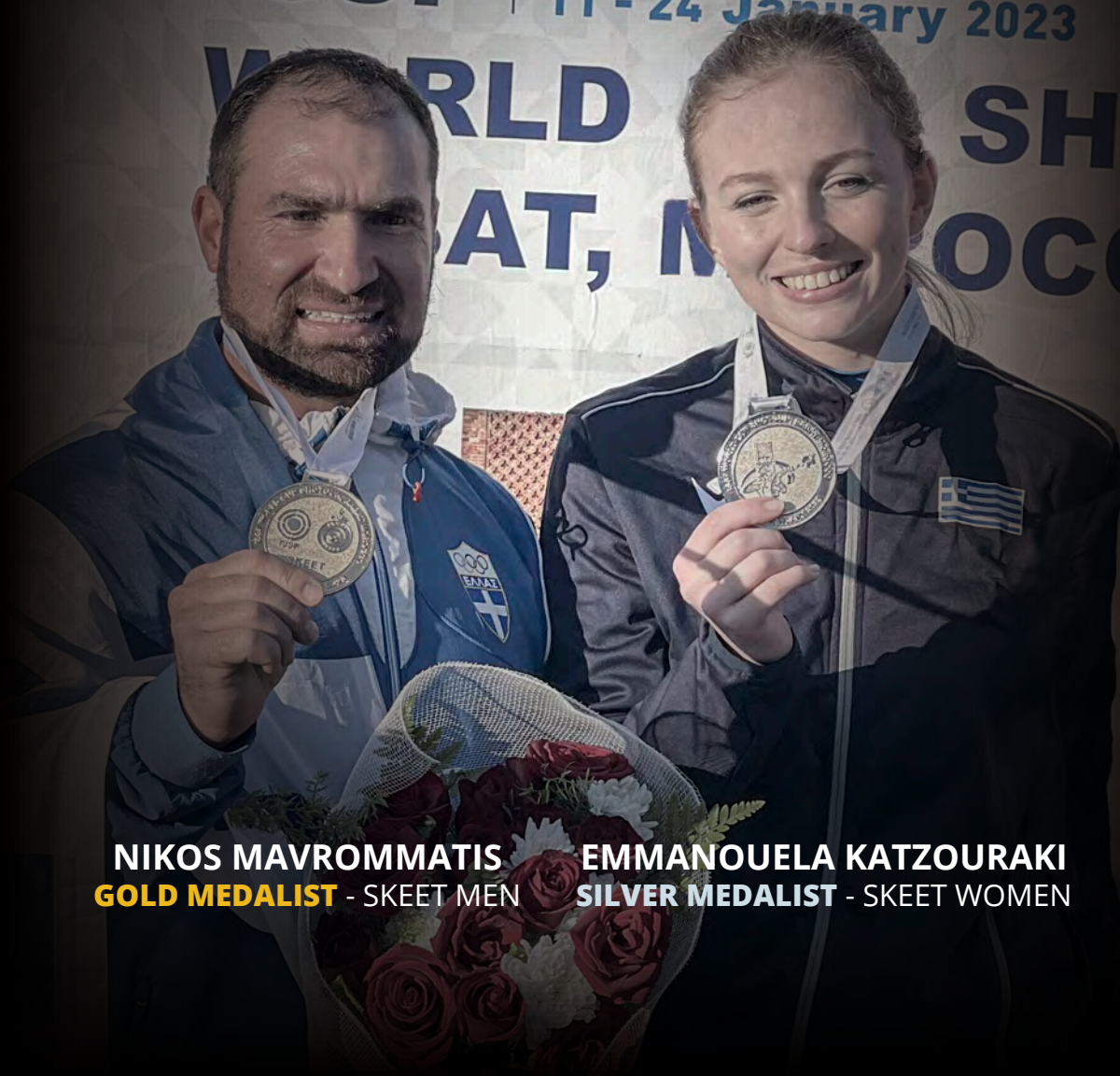
NIKOS MAVROMMATIS GOLD MEDALIST - SKEET MEN